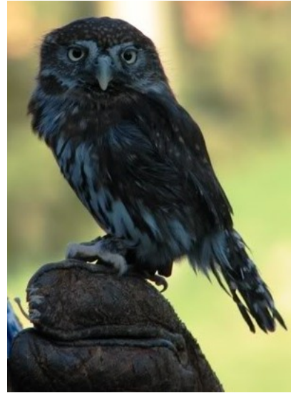
A tiny Elf Owl

Owls see in the same way that humans do, with both eyes straight ahead. This is called binocular vision and enables the bird to judge distances accurately. Their eyes have adapted to be able to see when it is almost dark. But like us, in total darkness they can see nothing, they always need some light to see.