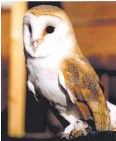
The European Barn Owl