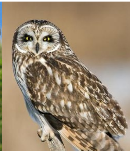
The Short-eared Owl