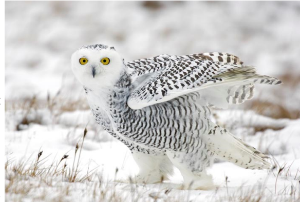
A snowy owl, its feathers matching its surroundings

Apart from specialised eyes and ears owls have other adaptations to assist their hunting; their plumage is soft and, except in the case of fish eating species and a few diurnal species, the flight feathers have fine, comb-like fringes which deaden the sound made by the movement of the wings through air. Not only does this mean that prey can't hear the approach of the owls, but the owl can still use its own hearing while airborne, without interference from the rush of air through its feathers. The owl's feathers are also coloured and patterned so that the bird is camouflaged and not easily seen. Owls, which live in deserts, are usually sandy-brown, owls that live in areas that have snow are usually white, owls that live in woodland areas are usually brown and owls, which live in rocky areas, are grey.