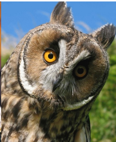
The Long-eared Owl