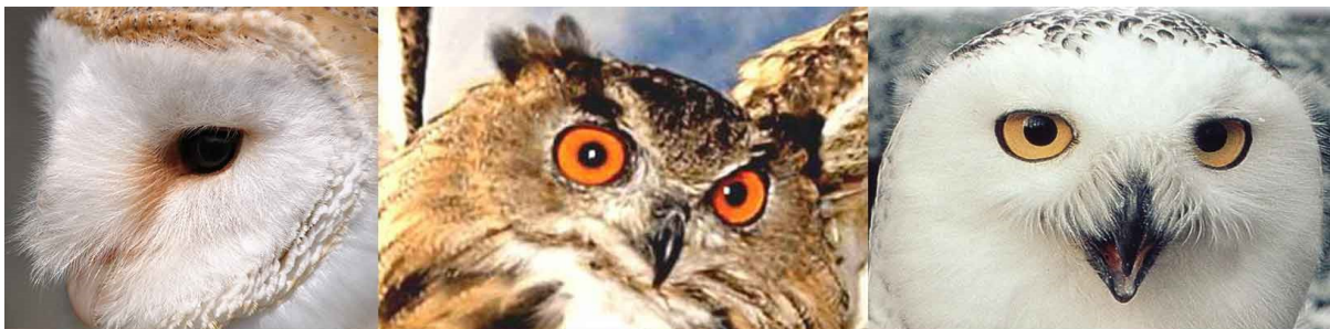
Owls Eye Colours

To look from side to side, the owls have to swivel their heads and they can see virtually all around themselves, up to 270 degrees. Like all birds of prey, owls have three eyelids - A top lid, a bottom lid and a third transparent membrane, which can move sideways to cover the eye at an incredible speed. This prevents damage to the eye when the owl is taking prey and feeding young.